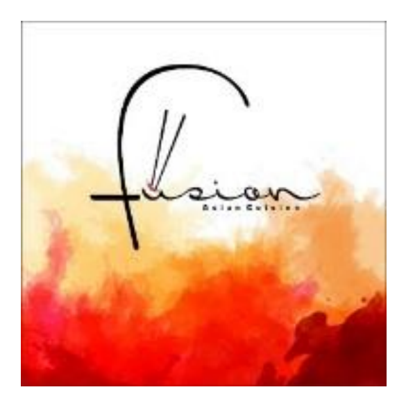
"We want to be different"